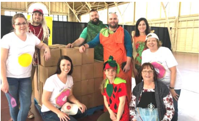
Trees of Hope 2018